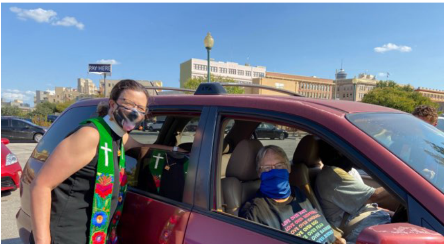
Blessing of the Animals