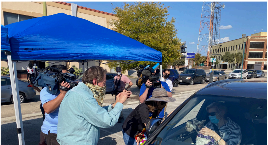
Blessing of the Animals