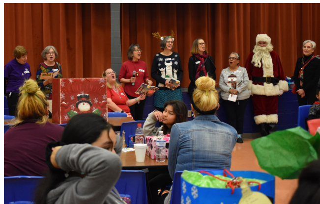
2019 Crockett Academy Christmas Party

Our annual holiday gift drive for Crockett Academy students is back! Our goal is to provide gifts for 75 children at the "Holiday Happiness Party" to be held at Crockett on December 16 at 9.00am. Through the help of some holiday elves, we know several wishes for each child on the list. You'll have a chance to sign up online to shop for a particular child, then wrap and deliver gifts to St. Mark's no later than Sunday, December 13. Alternately, you may wish to donate money and let Santa's little helper shop and deliver the gift to the church for you! Volunteers are also needed to assemble cookie and juice packets, help deliver gifts to Crockett, and assist with the (masked, distanced) party. To participate, visit the Advent/Christmas page of the website.